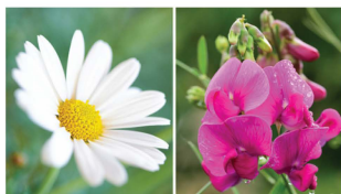
April Birth Flowers: Daisy and Sweet Pea

In April, you can plant warm-season vegetables, flowers, and herbs in Florida.